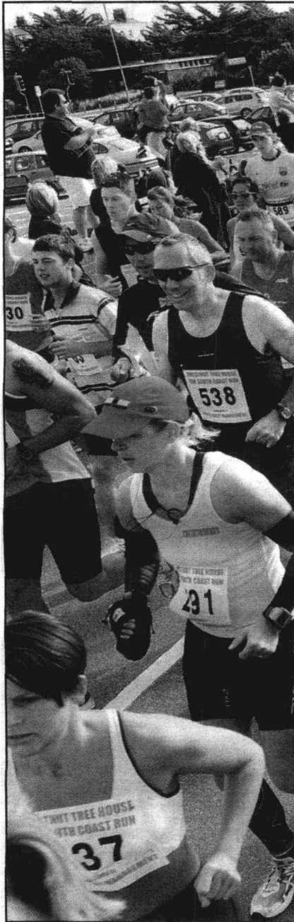
■ IN THE LONG RUN: Runners on their